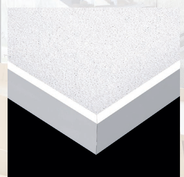
RETAIL - AXIOM L Canopy

Reception areas, meeting areas, circulation spaces, retail.